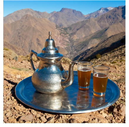
* longer routes available